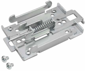
MA-1 Router DIN rail kit

Mounting standard: 35 mm DIN rail Material: Low carbon steel Weight: 57 g Dimensions: mm 82 x 46 x 20