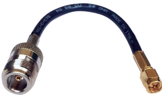
CA-1 Pigtail 15 cm RG-58 N female/SMA male

Cable type: RG-58 CU MIL Connector: N female / SMA male Length: 15 cm