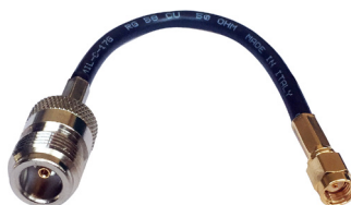
CA-2 Pigtail 15 cm RG-58 N female/SMA male RP

Cable type: RG-58 CU MIL Connector: N female / SMA male RP Length: 15 cm