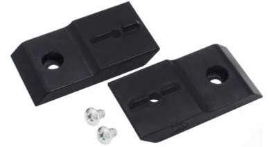
MA-3 Router surface mounting kit

Mounting standard: flat surface Material: ABS + PC plastic Weight: 2x5 g Dimensions: mm 25 x 48 x 7,5