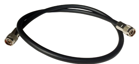
CA-3 Cable type LMR-400 1 m N male/N male

Cable type: LMR-400 Connector: N male / N male Length: 1 m