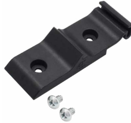
MA-2 Router compact DIN rail kit

Mounting standard: 35 mm DIN rail Material: ABS + PC plastic Weight: 6,5 g Dimensions: mm 70 x 25 x 14,5