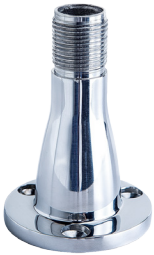
PA-40 Stainless steel marine mount

Mounting: 1" x 14 thread Material: Electropolished stainless steel Weight: 280 g Dimensions: mm 102 (h) x mm 70.5 (Ø)