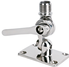
PA-30 Four way stainless steel ratchet mount

Mounting: 1" x 14 thread Material: Electropolished stainless steel Weight: 680 g Dimensions: mm 90 x 60 x 110 (h)